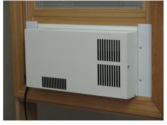
Figure 2: Screw the two sheet metal screws with strikes into the two holes, one on each side of the PuriFresh^{\otimes} ERV.