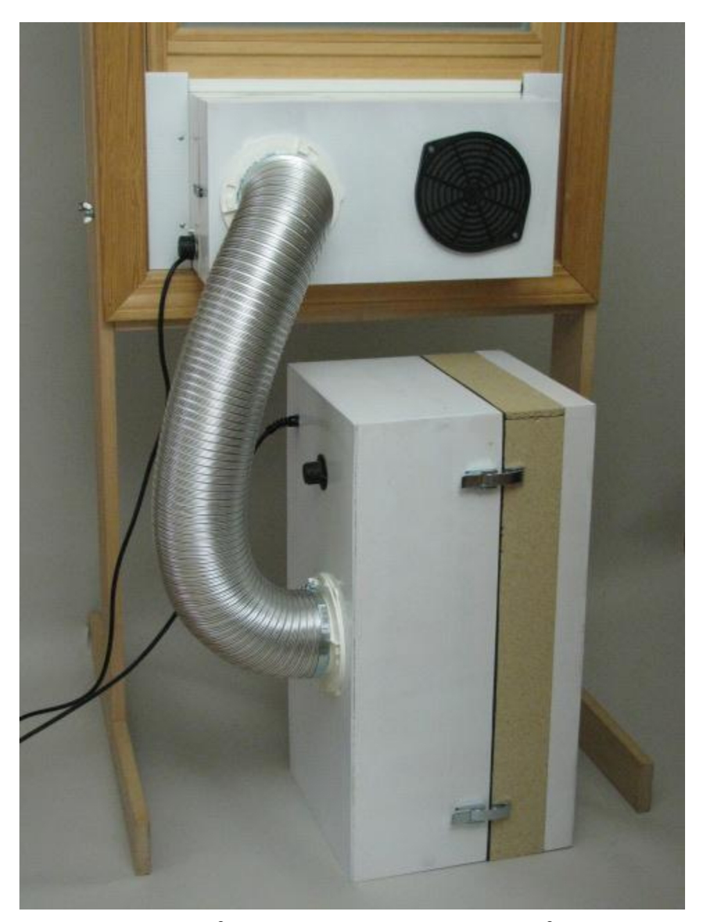
Figure 4: The PuriFresh® Clean Room connected to the PuriFresh® ERV using the PuriFresh® Fresh Air Duct Adapter.