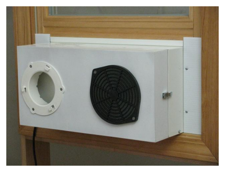
Figure 3: Hold the Fresh Air Duct Adapter up to the face of the ERV with the latches swung to the sides, then secure the latches to the strikes and close them.

Hold the PuriFresh® Fresh Air Duct Adapter up to the face of the PuriFresh® Energy Recovery Ventilator, with the latches swung to the sides. Secure the latches to the button strikes and close them, securing the Fresh Air Duct Adapter to the Energy Recovery Ventilator as shown in Figure 3.